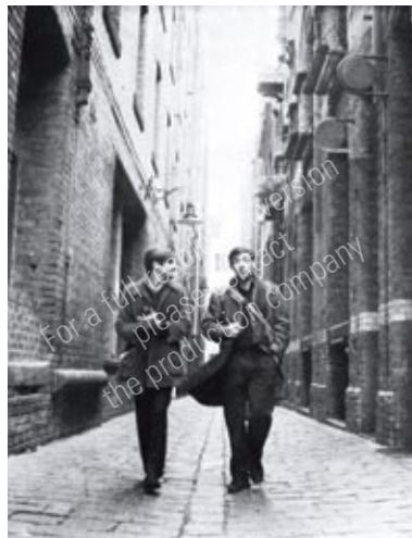
The Situationist drift through a Parisian alley (Recreation)