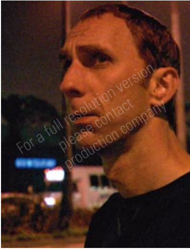
Will Self on Century Boulevard