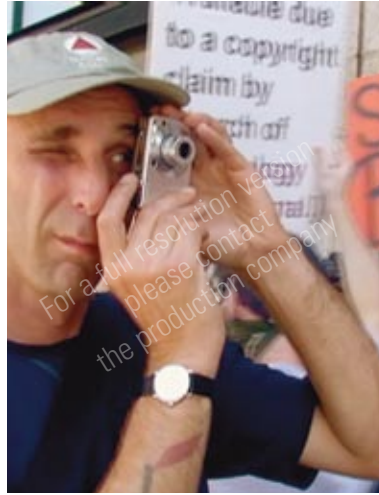
Will Self on Hollywood Boulevard