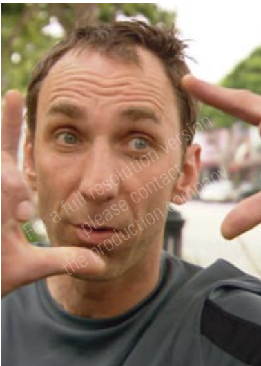
Will Self in LA