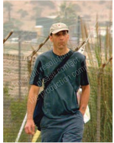
Will Self in the Baldwin Hills