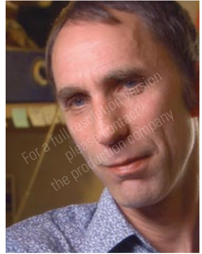
Will Self in his London office