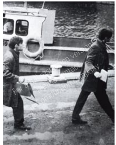
The Situationist drift by a Parisian canal (Recreation)