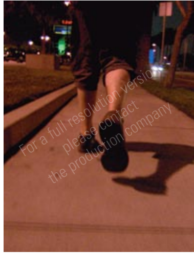
Will Self heads down Century Boulevard