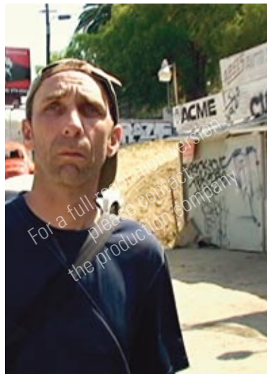
Will Self heads for Downtown LA