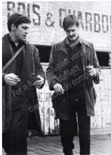
The Situationist drift through Paris on a 'dérive' (Recreation)