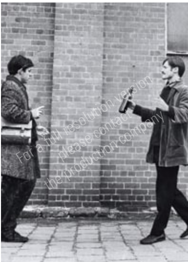
The Situationist on a 'dérive' in Paris (Recreation)