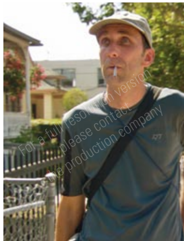
Will Self in South Central