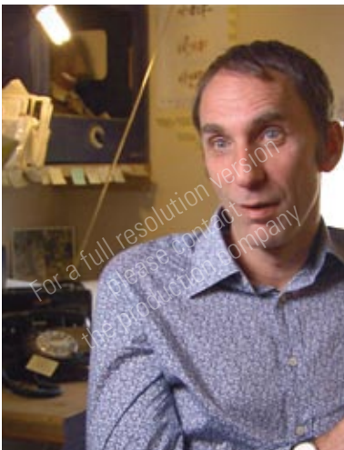
Will Self at his desk in London