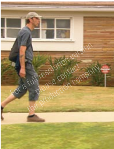
Will Self traverses suburban LA