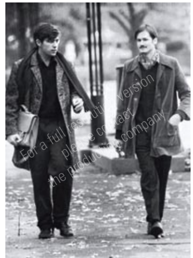
The Situationist walk by a Parisian canal (Recreation)